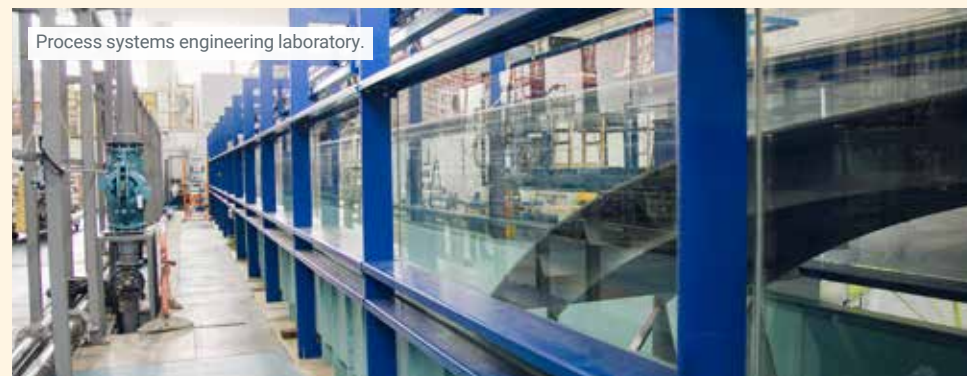
Process systems engineering laboratory.