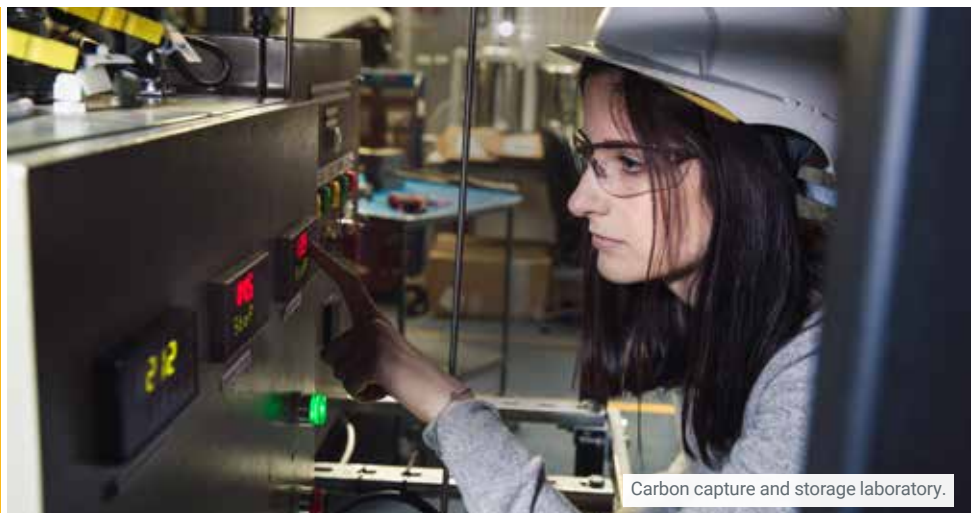
Carbon capture and storage laboratory.

Mechanical engineers remain in huge demand across the energy industry. This course provides real-world, industrially focused teaching to enhance career prospects.