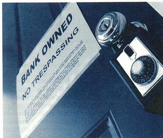
Subprime crisis born from good intentions

Serving poorer markets provides a rich vein of examples of companies that have created corporate social opportunities through innovation and adapting business models. In July, the United Nations Development Programme's Growing Inclusive Markets Initiative published a report called Creating Value for All: Strategies for Doing Business with the Poor . Companies highlighted include Smart Communications, a Philippines-based telecommunications business that sells prepaid phone cards with a mission "to make mobile phones as accessible to as many Filipinos as possible". It is now the Philippines' leading wireless services provider with 32 million subscribers. Other companies picked out include Danone, which is developing an affordable and highly nutritious milk porridge for malnourished children in Poland; Lafarge, which is rebuilding cement-based houses and businesses in