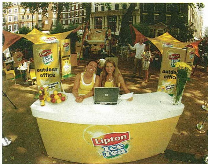
Quality brand image to a T

social opportunity is more likely to have eclectic and effective stakeholder engagement processes in place. Its employees, suppliers and business partners will have a better understanding of the company's interests in sustainability and where it might be particularly open to new ideas. Outsiders, such as NGOs or academic institutions, will be more likely to have the company on their radar screen as a potential collaborator and consider it more open to