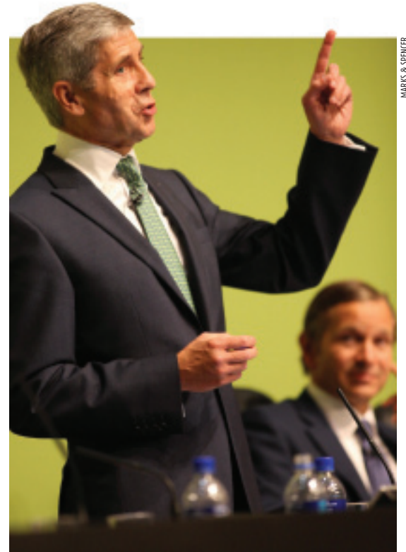
M&S's Rose and Bolland are aiming high

People at all levels of a company need to be