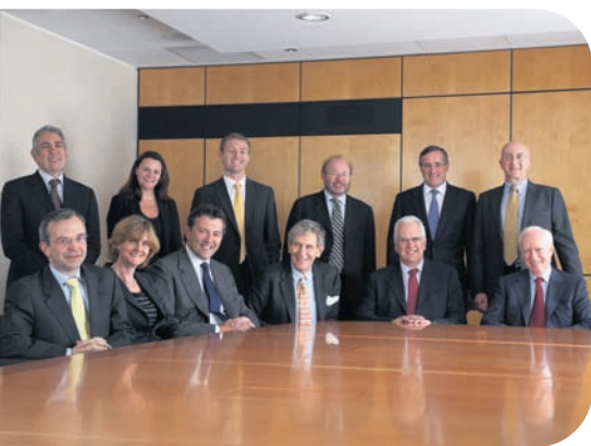
Inaugural meeting of Advisory Council, April 30th 2008