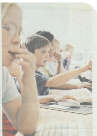
Supporting education: Henry's Computers for Schools scheme is a high-profile campaign