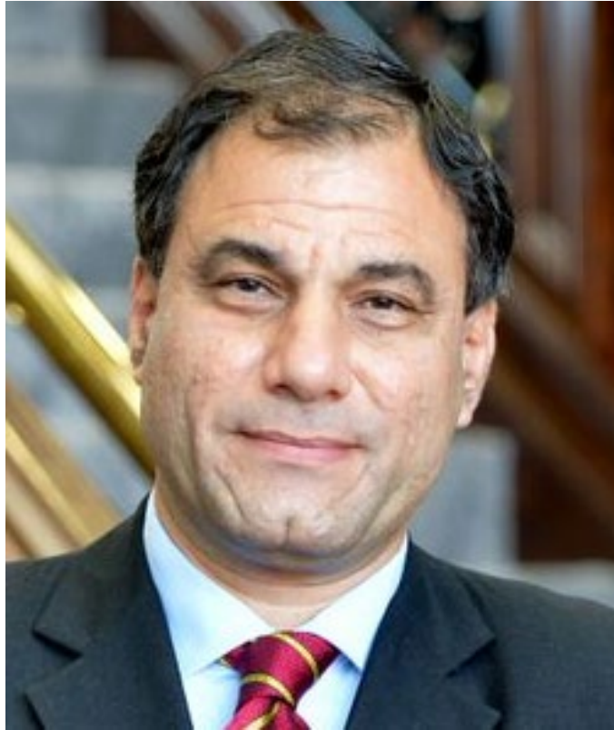
Lord Bilimoria CBE DL Founder, Cobra Beer (alumnus)