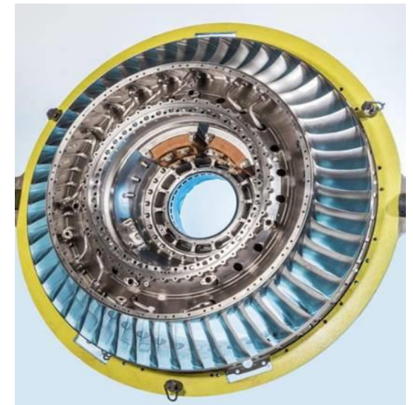
A350 –Trent 1000 Front Bearing Housing