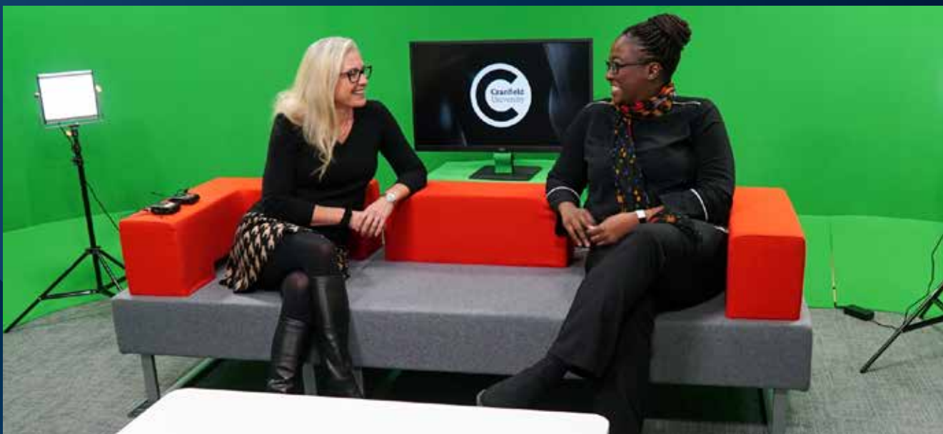
Each module will be taught through the Cranfield Broadcast and Record Studio live online