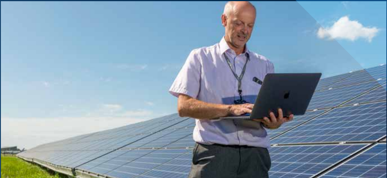
Solar Farm on Cranfield University campus