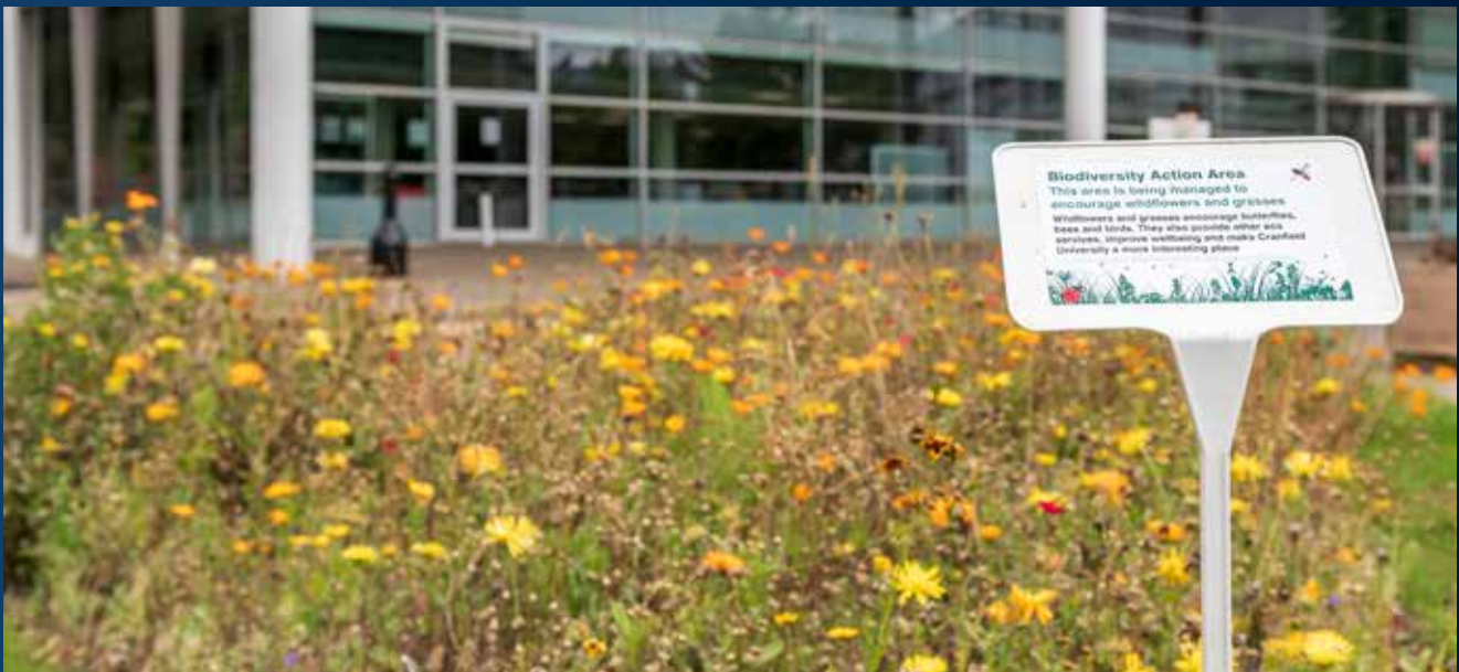
Biodiversity plots on Cranfield University campus