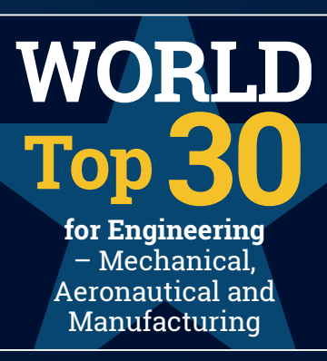
QS World University Rankings by Subject, 2022