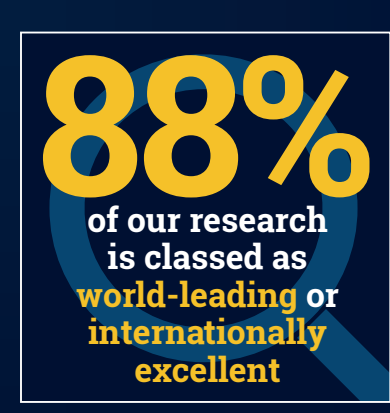
Research Excellence Framework, 2022

We are committed to playing our part in creating a better and more sustainable future for all and to achieving green economic recovery. We have also signed up to the UN Sustainable Development Goals Accord. Read more about how we are achieving this – www.cranfield.ac.uk/sdgaccord